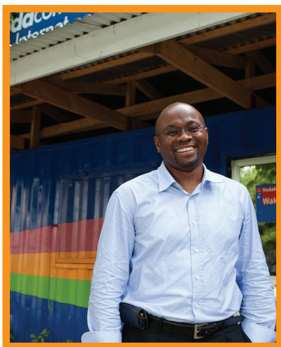
A Wireless Reach project partner outside one of the initial Vodacom cafés.